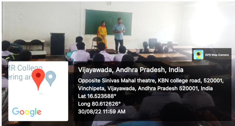
P.Arun Teja, BDA at BYJU'S, , Ms.G.Sai Keerthana, ,OT at Focus Edumatic of MBA 2020 – 2022 Batch interacting with MBA 2021 – 2023 batch